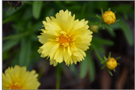
Leading Lady Charlize Tickseed flowers

Leading Lady Charlize Tickseed is recommended for the following landscape applications;