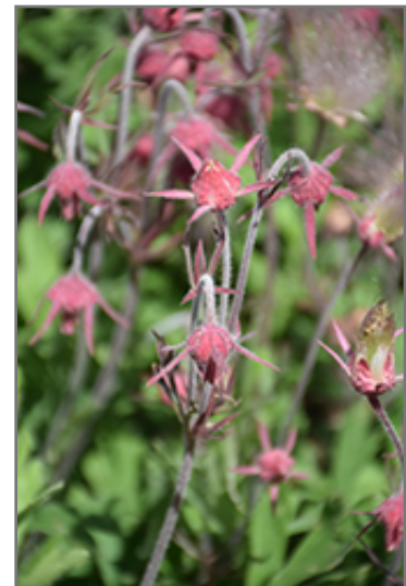
Prairie Smoke flower buds