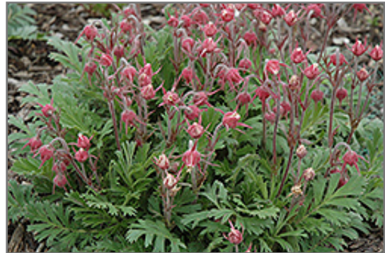
Prairie Smoke in bloom

Prairie Smoke is an herbaceous perennial with an upright spreading habit of growth. Its relatively fine texture sets it apart from other garden plants with less refined foliage.