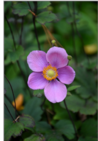
Lucky Charm Anemone flowers