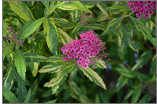
Double Play Painted Lady Spirea flowers

Double Play Painted Lady Spirea is recommended for the following landscape applications;