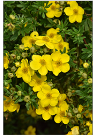
Happy Face Yellow Potentilla flowers

Happy Face Yellow Potentilla is recommended for the following landscape applications;