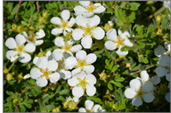
Happy Face White Potentilla flowers