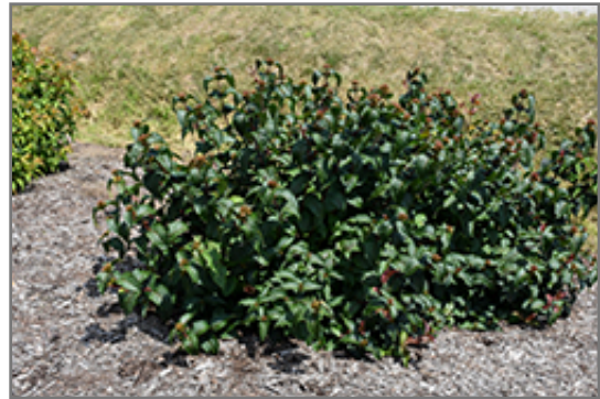
Kodiak Black Diervilla