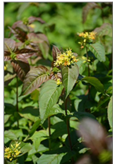
Kodiak Black Diervilla flowers