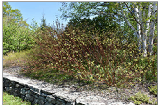
Bailey's Red Twig Dogwood in spring