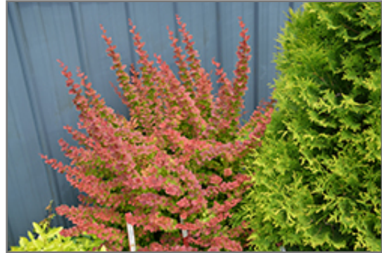
Sunjoy Tangelo Japanese Barberry

Sunjoy Tangelo Japanese Barberry will grow to be about 4 feet tall at maturity, with a spread of 4 feet. It tends to fill out right to the ground and therefore doesn't necessarily require facer plants in front. It grows at a medium rate, and under ideal conditions can be expected to live for approximately 20 years.