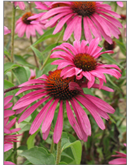
Ruby Star Coneflower flowers

Ruby Star Coneflower is recommended for the following landscape applications;