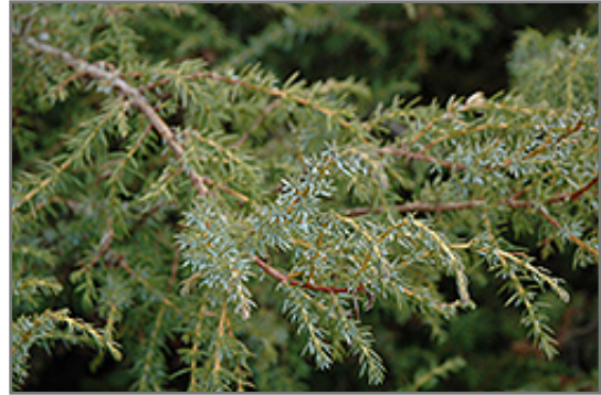
Common Juniper foliage