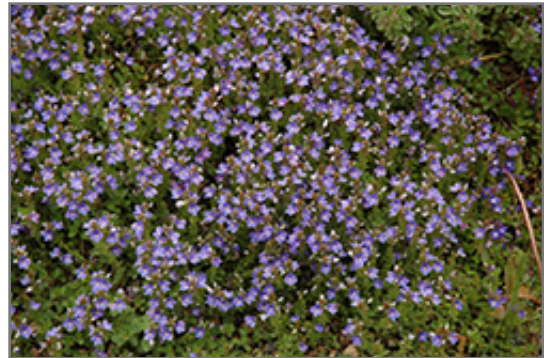
Turkish Speedwell in bloom

This is a relatively low maintenance plant, and should only be pruned after flowering to avoid removing any of the current season's flowers. It is a good choice for attracting butterflies to your yard, but is not particularly attractive to deer who tend to leave it alone in favor of tastier treats. It has no significant negative characteristics.