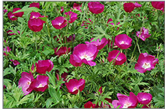
Buffalo Poppy flowers

Buffalo Poppy is recommended for the following landscape applications;