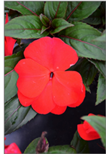
Divine Scarlet Bronze Leaf New Guinea Impatiens flowers

Divine Scarlet Bronze Leaf New Guinea Impatiens is recommended for the following landscape applications;