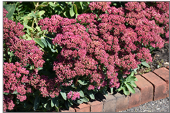
Carl Stonecrop in bloom

Carl Stonecrop is a dense herbaceous perennial with an upright spreading habit of growth. Its medium texture blends into the garden, but can always be balanced by a couple of finer or coarser plants for an effective composition.