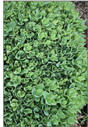
Carl Stonecrop foliage

Carl Stonecrop is a fine choice for the garden, but it is also a good selection for planting in outdoor pots and containers. It is often used as a 'filler' in the 'spiller-thriller-filler' container combination, providing a mass of flowers and foliage against which the larger thriller plants stand out. Note that when growing plants in outdoor containers and baskets, they may require more frequent waterings than they would in the yard or garden.