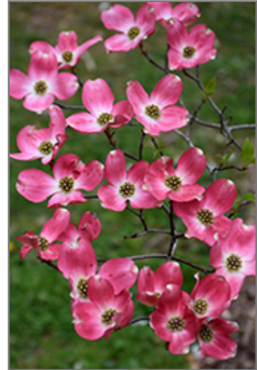
Red Flowering Dogwood flowers