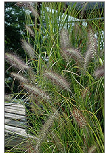
Cassian Dwarf Fountain Grass flowers