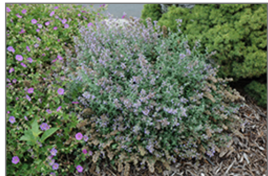
Cat's Meow Catmint in bloom