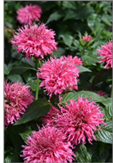
Bubblegum Blast Beebalm flowers