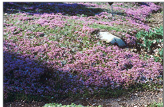
Mother-of-Thyme in bloom

Ann Arbor 734-332-7900 155 N. Maple at Jackson