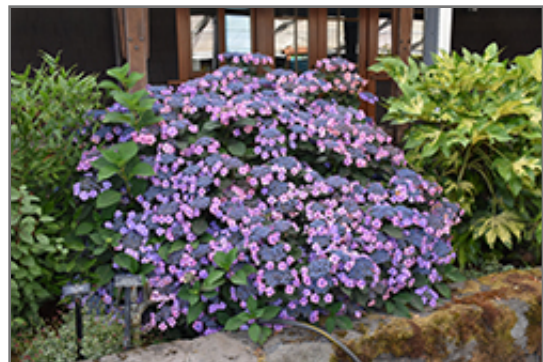
Tuff Stuff Hydrangea in bloom