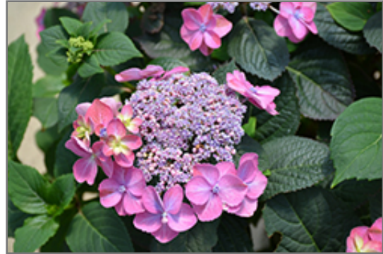
Tuff Stuff Hydrangea flowers

Tuff Stuff Hydrangea makes a fine choice for the outdoor landscape, but it is also well-suited for use in outdoor pots and containers. With its upright habit of growth, it is best suited for use as a 'thriller' in the 'spiller-thriller-filler' container combination; plant it near the center of the pot, surrounded by smaller plants and those that spill over the edges. It is even sizeable enough that it can be grown alone in a suitable container. Note that when grown in a container, it may not perform exactly as indicated on the tag - this is to be expected. Also note that when growing plants in outdoor containers and baskets, they may require more frequent waterings than they would in the yard or garden.