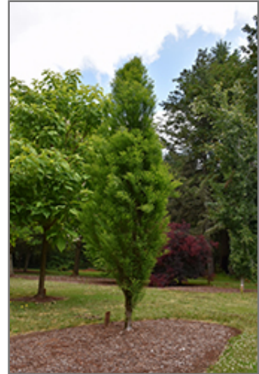
Lindsey's Skyward Bald Cypress