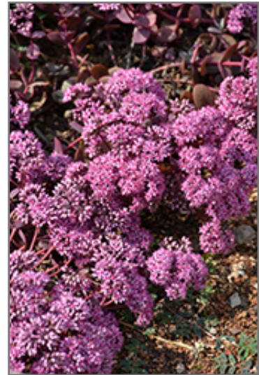
Cherry Tart Stonecrop flowers

Cherry Tart Stonecrop is a fine choice for the garden, but it is also a good selection for planting in outdoor pots and containers. It is often used as a 'filler' in the 'spiller-thriller-filler' container combination, providing a mass of flowers and foliage against which the larger thriller plants stand out. Note that when growing plants in outdoor containers and baskets, they may require more frequent waterings than they would in the yard or garden.