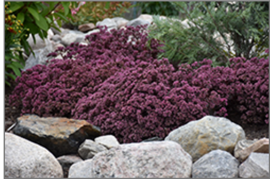
Cherry Tart Stonecrop in bloom

Cherry Tart Stonecrop is a dense herbaceous perennial with an upright spreading habit of growth. Its medium texture blends into the garden, but can always be balanced by a couple of finer or coarser plants for an effective composition.