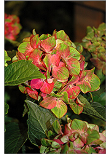
Pistachio Hydrangea flowers

Pistachio Hydrangea is recommended for the following landscape applications;