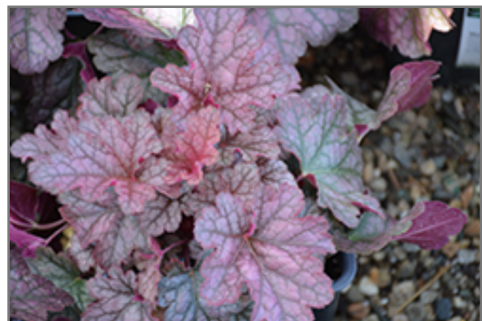
Kira Purple Rain Forest Coral Bells foliage