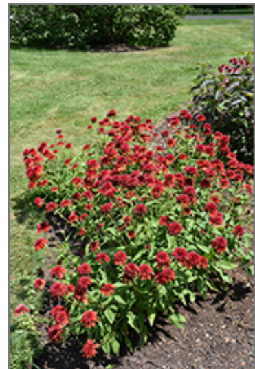
Double Scoop Orangeberry Coneflower in bloom

Ann Arbor 734-332-7900 155 N. Maple at Jackson