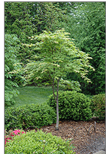
Osakazuki Japanese Maple