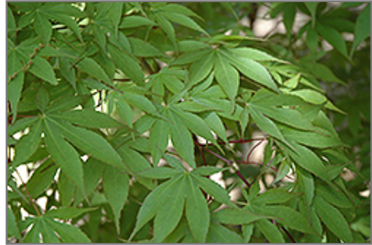
Osakazuki Japanese Maple foliage

This is a relatively low maintenance tree, and should only be pruned in summer after the leaves have fully developed, as it may 'bleed' sap if pruned in late winter or early spring. It has no significant negative characteristics.