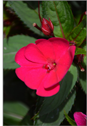
SunPatiens Compact Royal Magenta New Guinea Impatiens flowers

This plant will require occasional maintenance and upkeep, and should not require much pruning, except when necessary, such as to remove dieback. It is a good choice for attracting bees and butterflies to your yard. It has no significant negative characteristics.