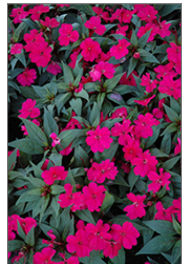
SunPatiens Compact Royal Magenta New Guinea Impatiens flowers

Ann Arbor 734-332-7900 155 N. Maple at Jackson