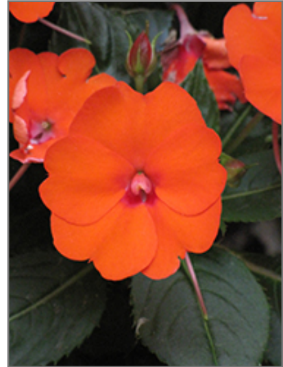
SunPatiens Compact Electric Orange New Guinea Impatiens flowers

This plant will require occasional maintenance and upkeep, and should not require much pruning, except when necessary, such as to remove dieback. It is a good choice for attracting bees and butterflies to your yard. It has no significant negative characteristics.