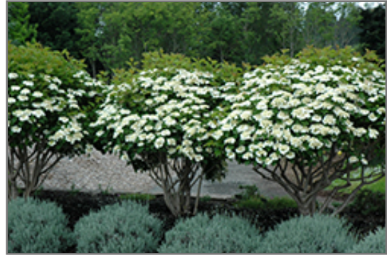
Compact European Cranberry in bloom

Compact European Cranberry is a dense multi-stemmed deciduous shrub with a more or less rounded form. Its average texture blends into the landscape, but can be balanced by one or two finer or coarser trees or shrubs for an effective composition.