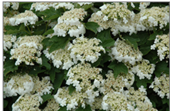
Compact European Cranberry flowers