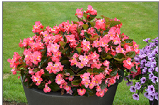
Surefire Rose Begonia in bloom

Ann Arbor 734-332-7900 155 N. Maple at Jackson