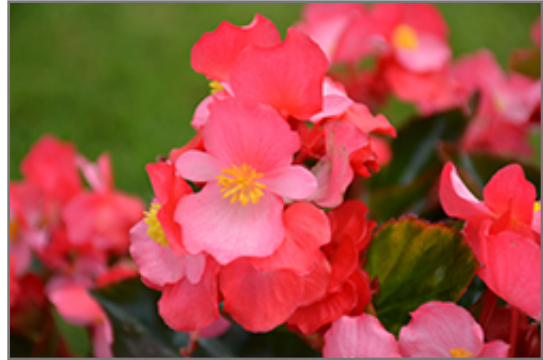
Surefire Rose Begonia flowers

Surefire Rose Begonia is an herbaceous annual with an upright spreading habit of growth. Its medium texture blends into the garden, but can always be balanced by a couple of finer or coarser plants for an effective composition.