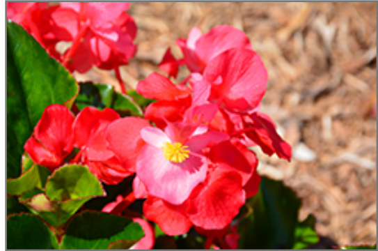
Whopper Rose Green Leaf Begonia flowers

Whopper Rose Green Leaf Begonia is an herbaceous annual with a mounded form. Its medium texture blends into the garden, but can always be balanced by a couple of finer or coarser plants for an effective composition.