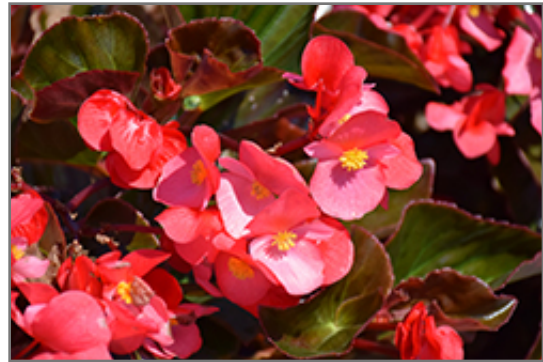
Whopper Rose Bronze Leaf Begonia flowers

This is a high maintenance plant that will require regular care and upkeep, and usually looks its best without pruning, although it will tolerate pruning. Deer don't particularly care for this plant and will usually leave it alone in favor of tastier treats. Gardeners should be aware of the following characteristic(s) that may warrant special consideration;