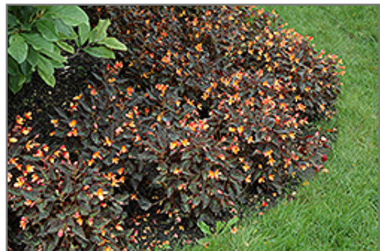
Sparks Will Fly Begonia in bloom