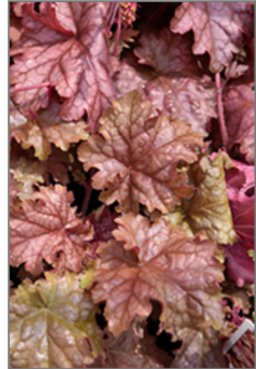
Carnival Peach Parfait Coral Bells foliage

Carnival Peach Parfait Coral Bells is recommended for the following landscape applications;