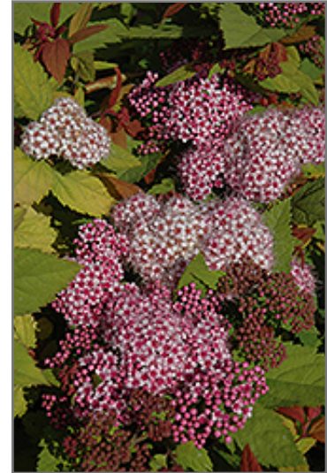
Double Play Big Bang Spirea flowers

This shrub will require occasional maintenance and upkeep, and is best pruned in late winter once the threat of extreme cold has passed. It is a good choice for attracting butterflies to your yard, but is not particularly attractive to deer who tend to leave it alone in favor of tastier treats. It has no significant negative characteristics.