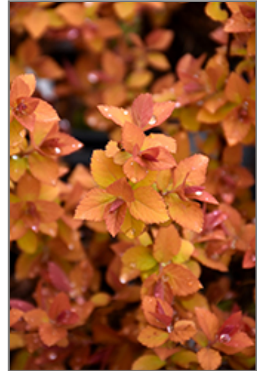
Double Play Big Bang Spirea foliage

This shrub should only be grown in full sunlight. It prefers to grow in average to moist conditions, and shouldn't be allowed to dry out. It is not particular as to soil type or pH. It is highly tolerant of urban pollution and will even thrive in inner city environments. This particular variety is an interspecific hybrid.