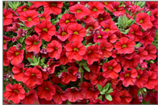
Superbells Red Calibrachoa flowers

Superbells Red Calibrachoa is recommended for the following landscape applications;