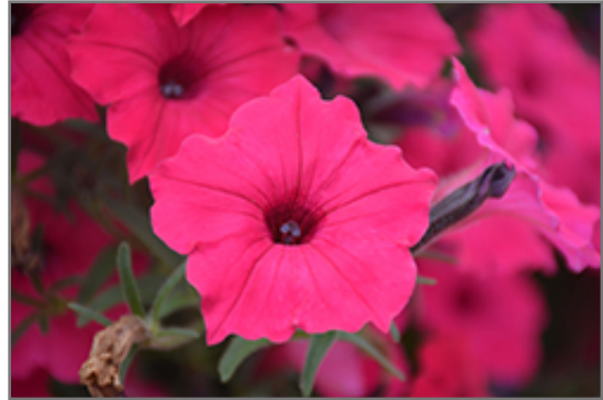
Supertunia Vista Fuchsia Petunia flowers

Supertunia Vista Fuchsia Petunia is recommended for the following landscape applications;