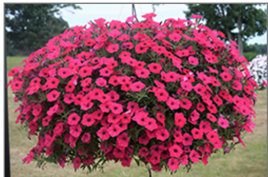
Supertunia Vista Fuchsia Petunia in bloom