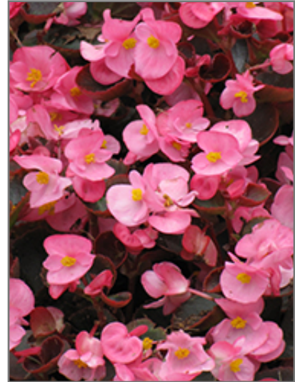
Bada Boom Pink Begonia flowers