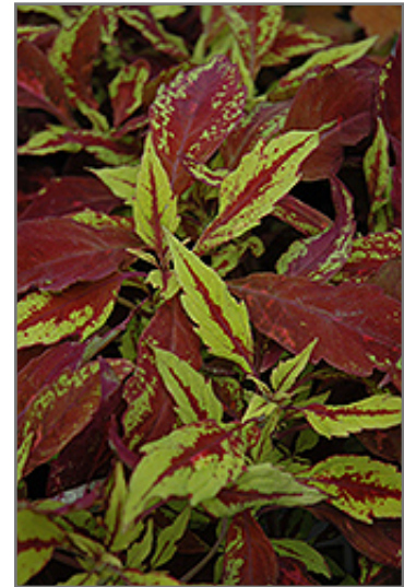
Pineapple Coleus foliage