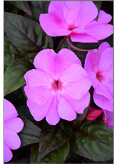
Divine Lavender New Guinea Impatiens flowers

Divine Lavender New Guinea Impatiens is recommended for the following landscape applications;