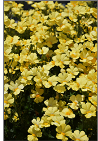
Sunsatia Lemon Nemesia flowers