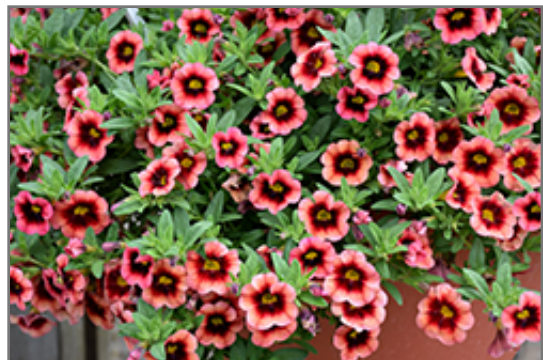
Superbells Coralberry Punch Calibrachoa flowers

Ann Arbor 734-332-7900 155 N. Maple at Jackson