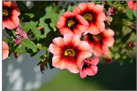
Superbells Coralberry Punch Calibrachoa flowers

Superbells Coralberry Punch Calibrachoa is a dense herbaceous annual with a trailing habit of growth, eventually spilling over the edges of hanging baskets and containers. Its medium texture blends into the garden, but can always be balanced by a couple of finer or coarser plants for an effective composition.