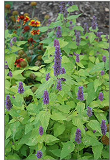
Golden Jubilee Anise Hyssop flowers

Golden Jubilee Anise Hyssop is recommended for the following landscape applications;