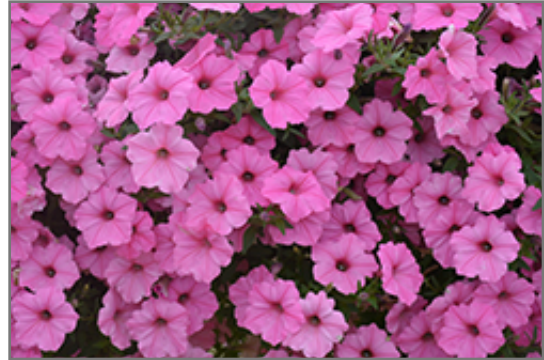
Supertunia Vista Bubblegum Petunia flowers

Supertunia Vista Bubblegum Petunia is recommended for the following landscape applications;