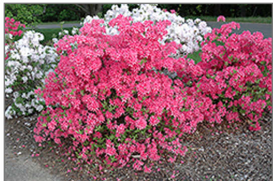
Rosy Lights Azalea in bloom

Ann Arbor 734-332-7900 155 N. Maple at Jackson