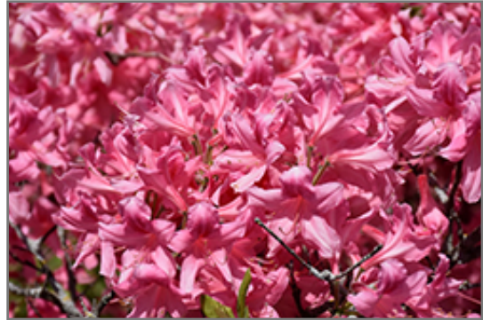
Rosy Lights Azalea flowers

Rosy Lights Azalea is recommended for the following landscape applications;