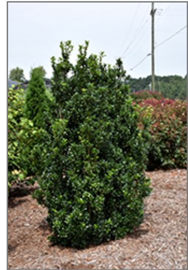
Castle Wall Meserve Holly

Castle Wall Meserve Holly is recommended for the following landscape applications;