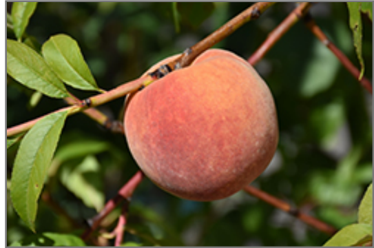
Redhaven Peach fruit