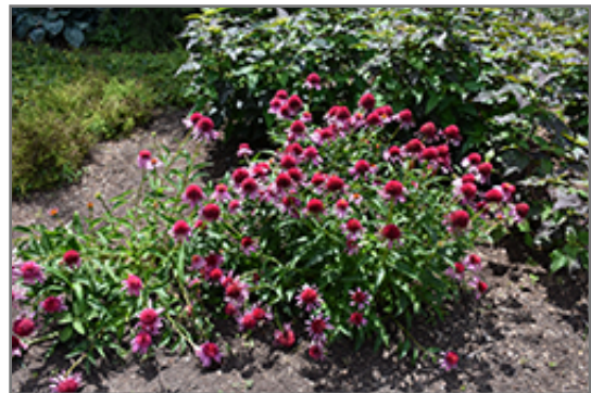
Double Scoop Bubble Gum Coneflower in bloom

Ann Arbor 734-332-7900 155 N. Maple at Jackson