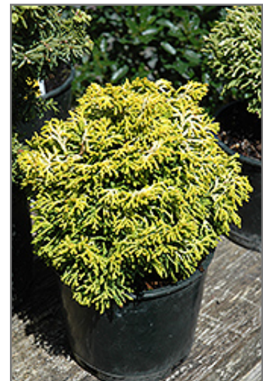
Butterball Hinoki Falsecypress

Ann Arbor 734-332-7900 155 N. Maple at Jackson